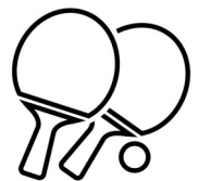
Table tennis is being held in the Christ Church Hall every Saturday from 4.00—6.00pm. Come along and join in the fun! A gold coin donation would be appreciated.