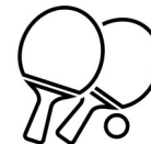
Table Tennis / games afternoons

(Paying by direct debit not only enables the admin staff to accurately record your giving [whether done weekly, fortnightly, monthly etc.], but it also reduces the burden on the money counters each week).